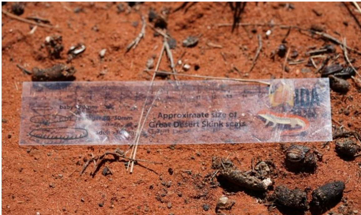
Great Desert Skink scats with ruler for scale.